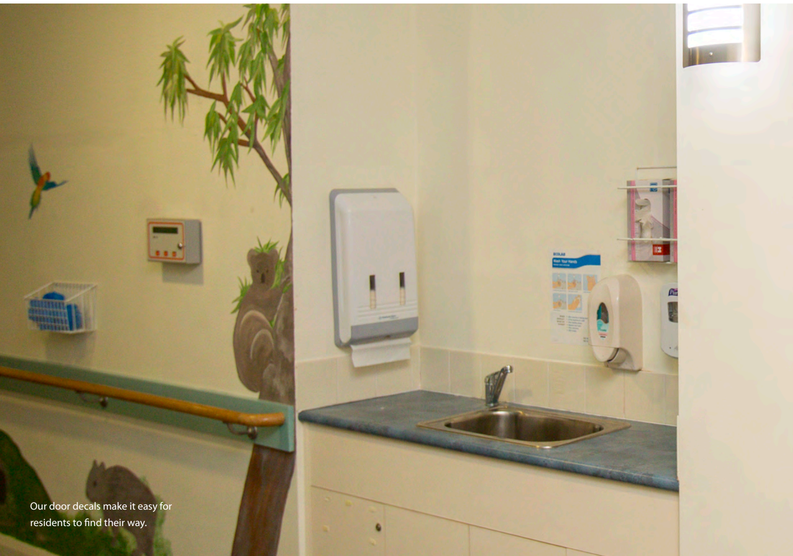
Our door decals make it easy for residents to find their way.

Our aged care centre offers professional personalised care in a comfortable and supported community spread across two buildings and surrounded by extensive gardens that feature courtyards, sitting areas and a manicured lawn. Choose from a range of private and shared suites, or experience specialised dementia and palliative care in a secure environment. Our experienced staff and Registered Nurses are on hand 24/7 ensuring you're comfortable and well cared for.