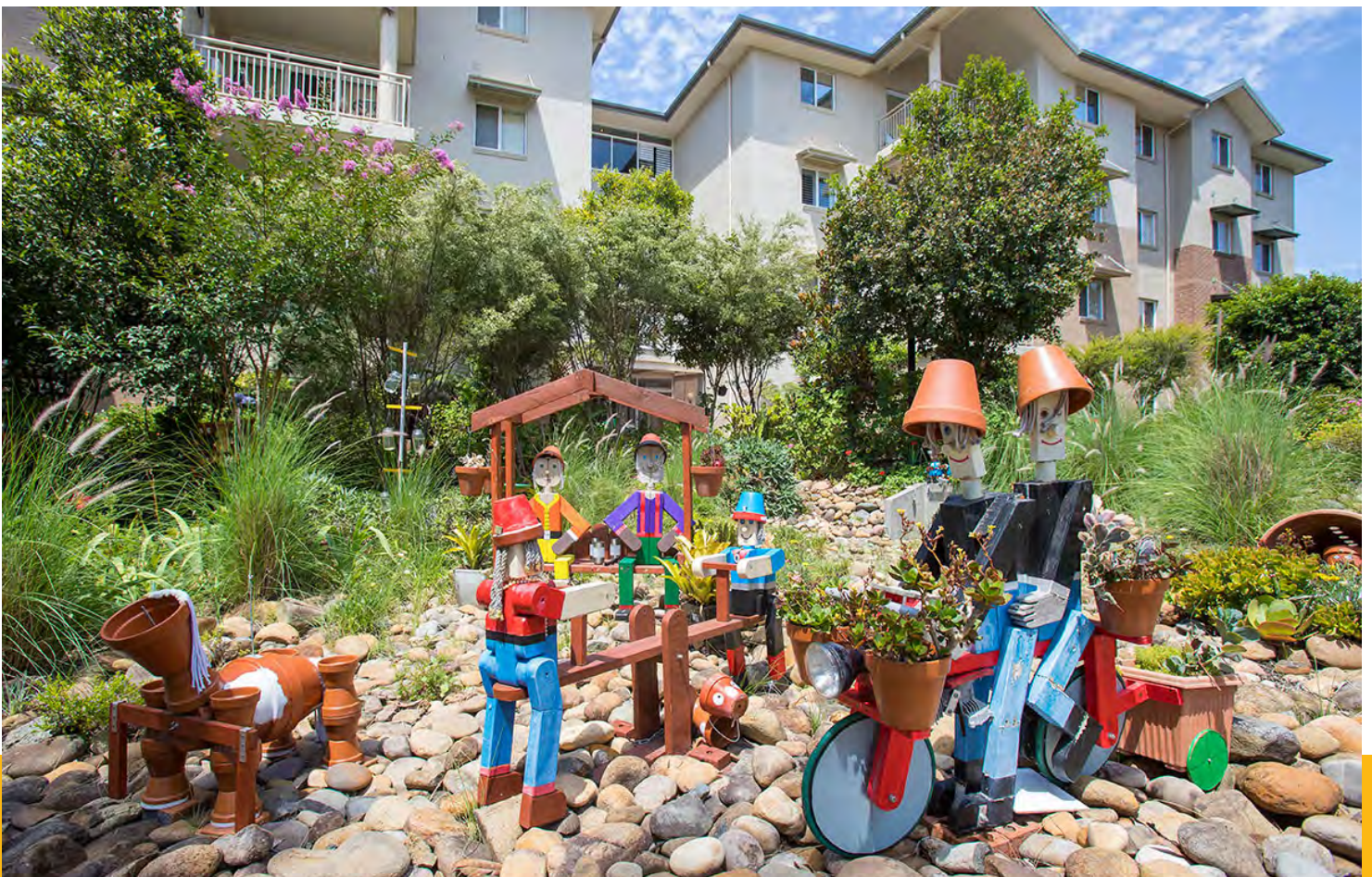
Top left - Relax in our secure outdoor areas.