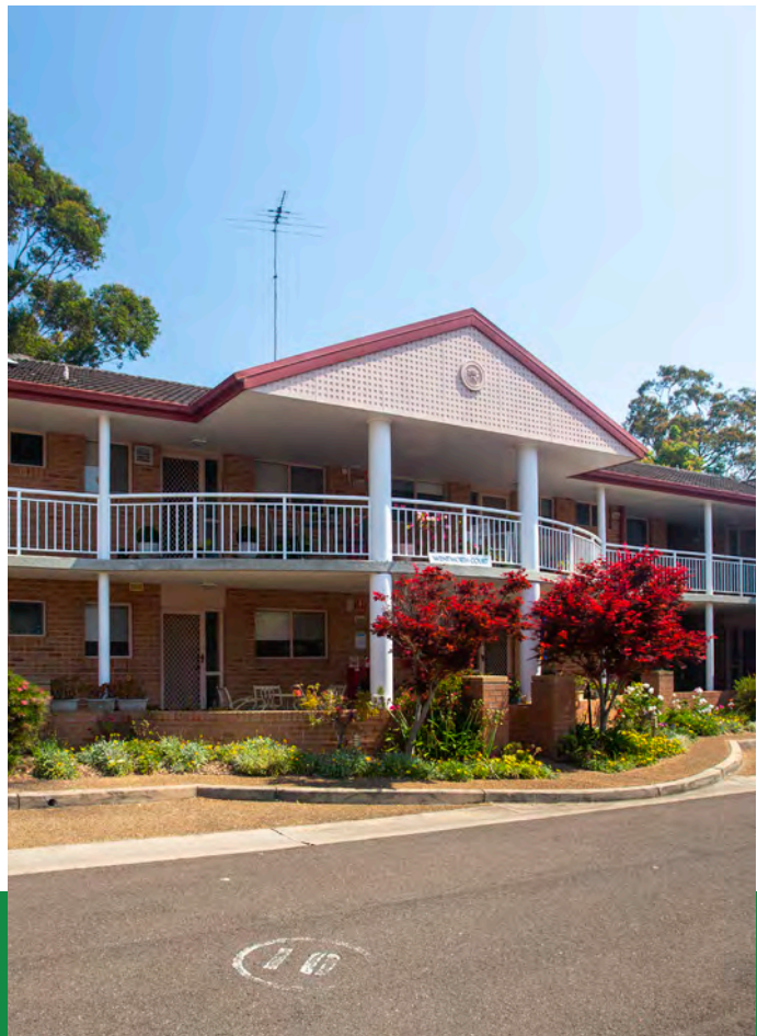
Top left - Flametree Aged Care Centre.