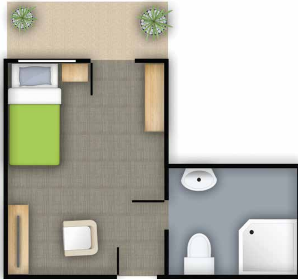
Private, suite Type A