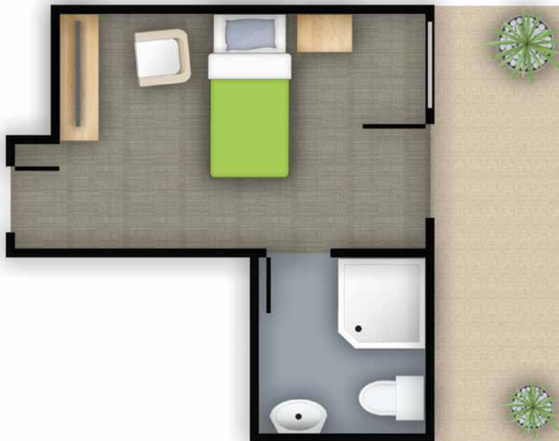
Private, suite Type B