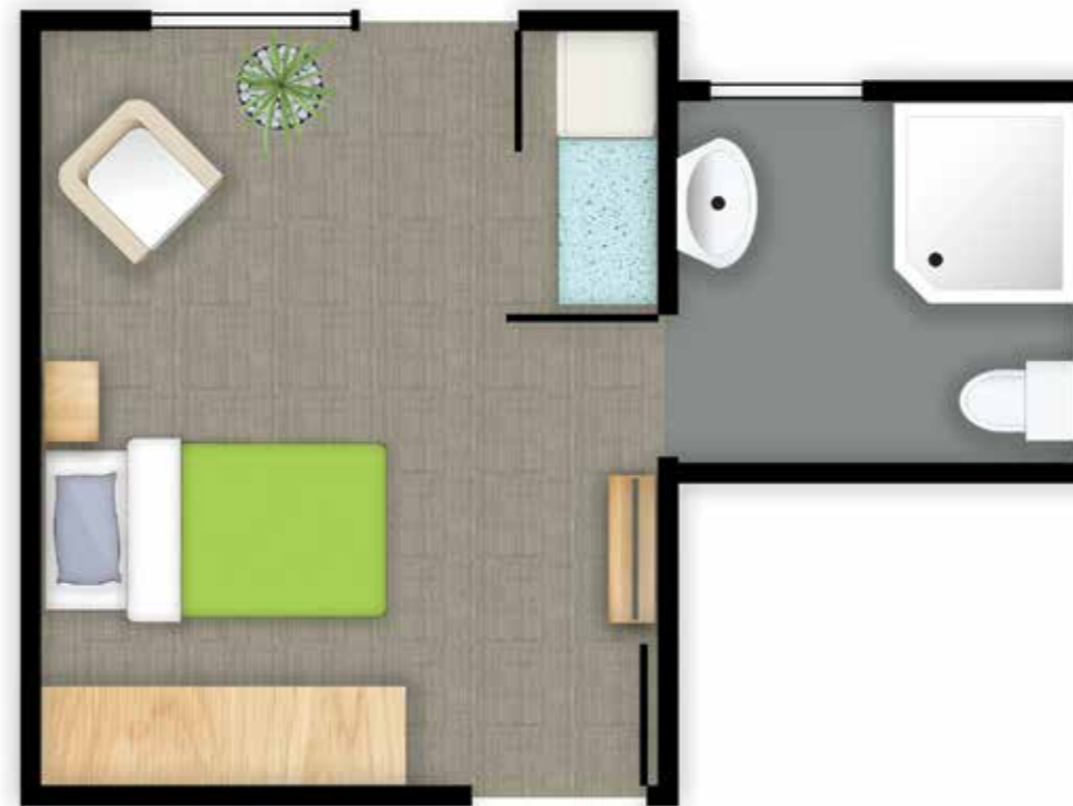
Private, suites Typical