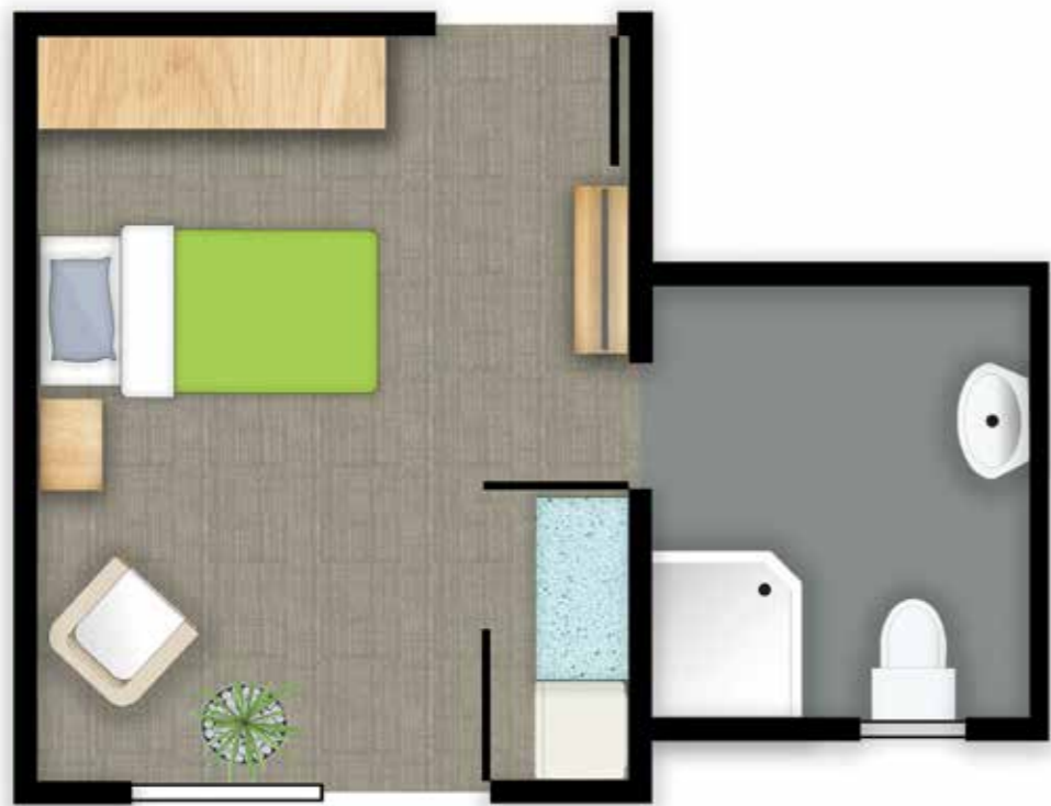
Private, suite Accessible