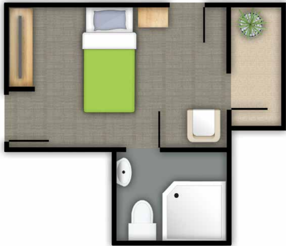
Private, suite Accessible