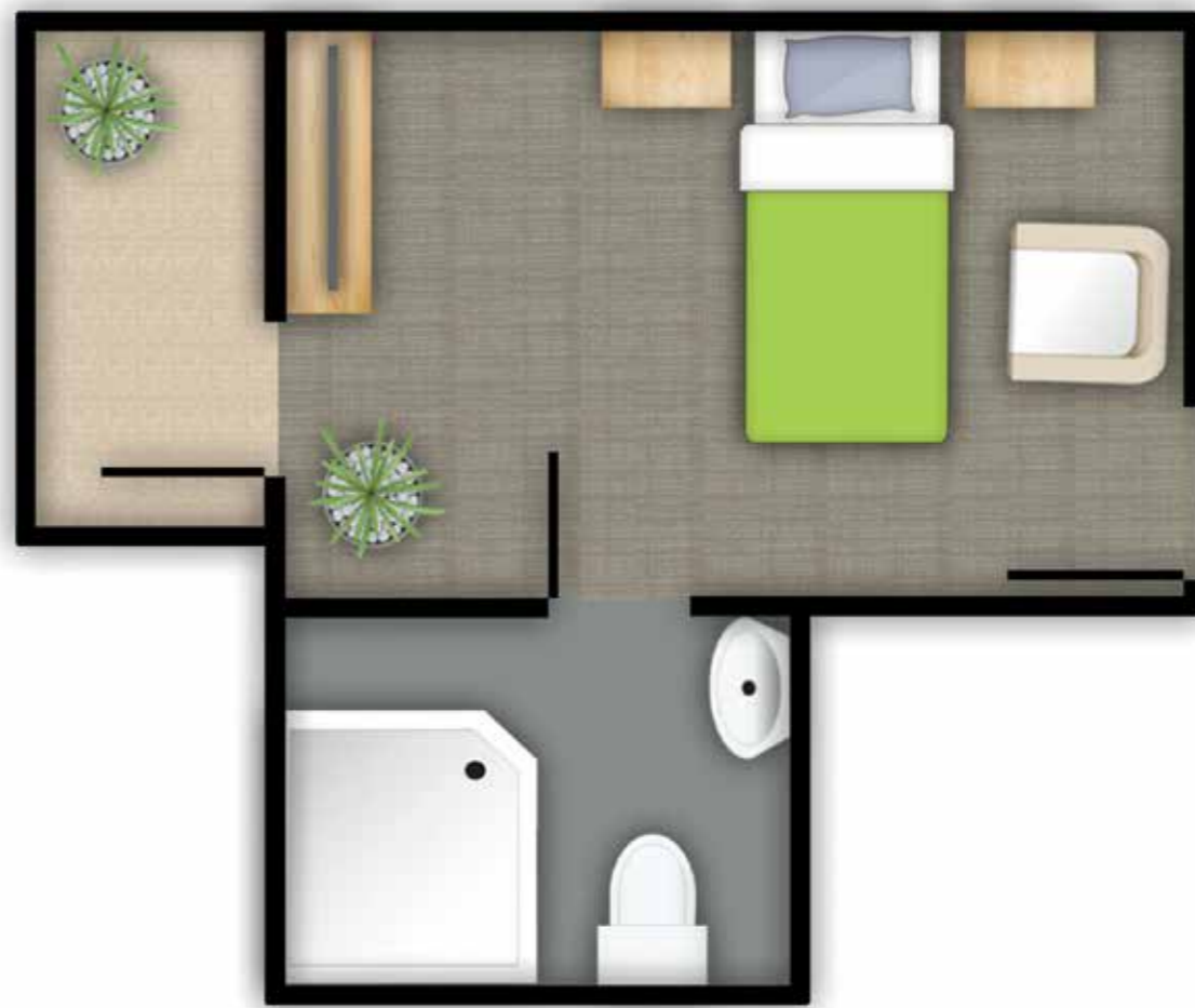
Private, suite Typical