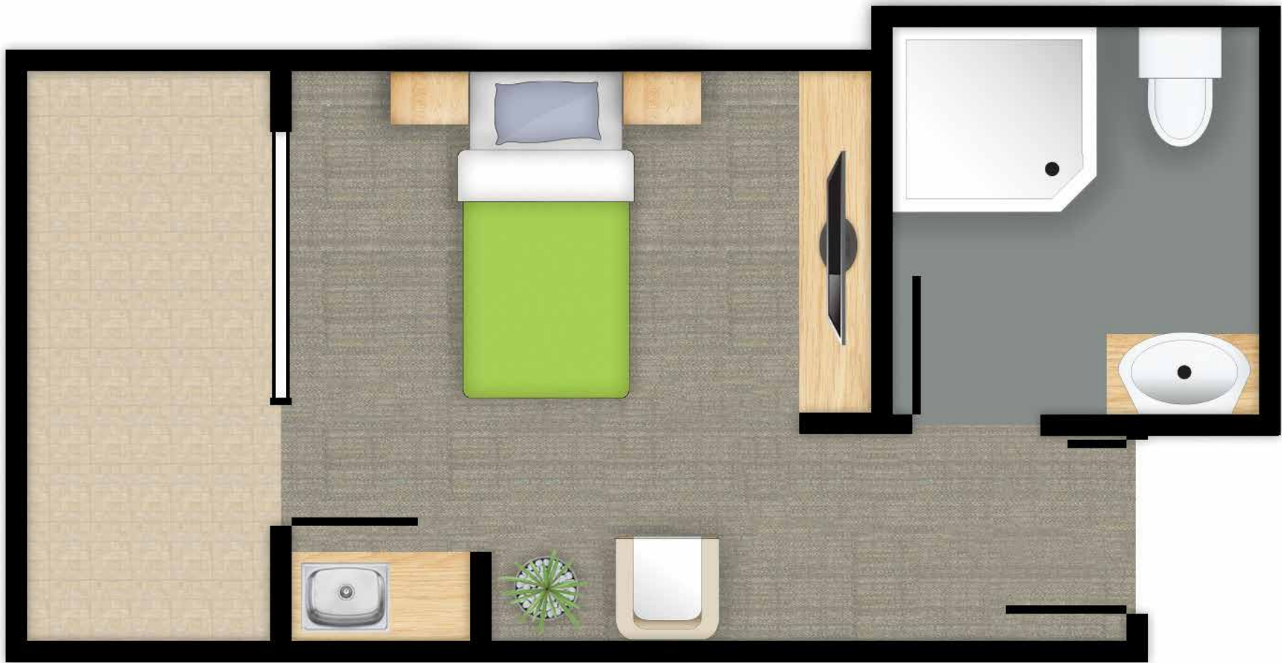
Private, suite Accessible