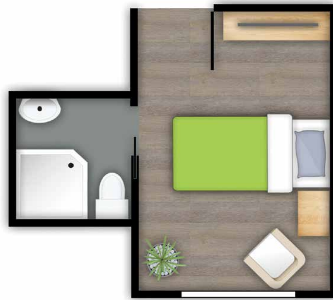
Private, suite Typical