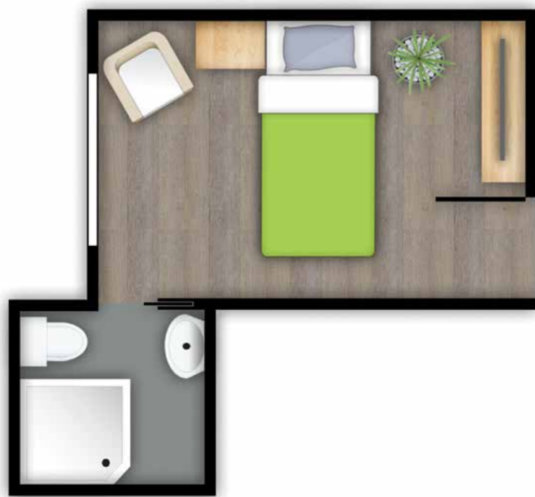
Private, suite Accessible