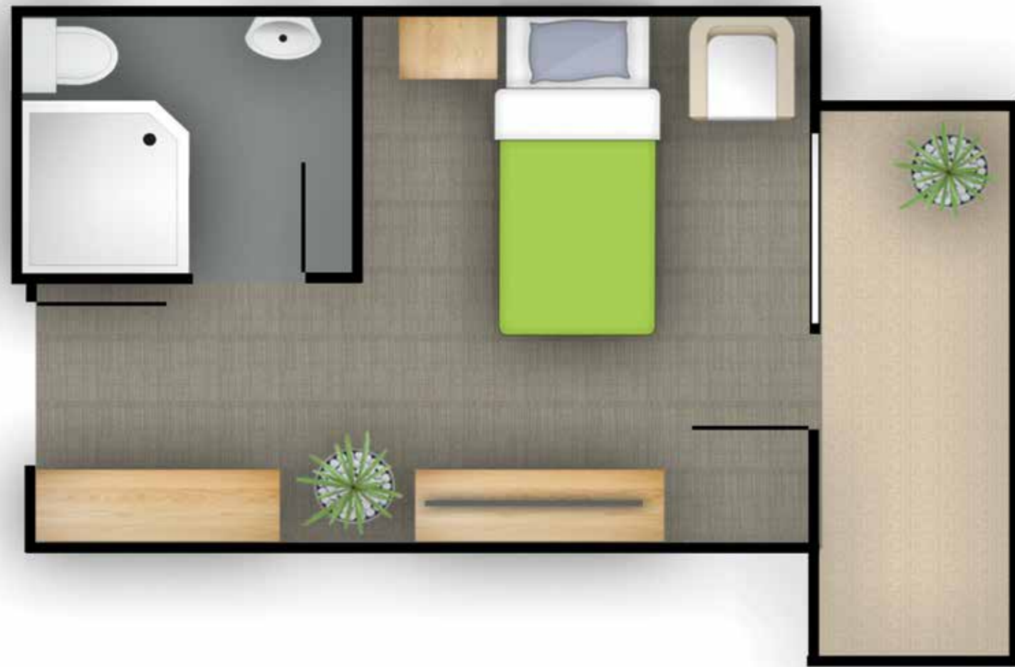
Private, suite Accessible