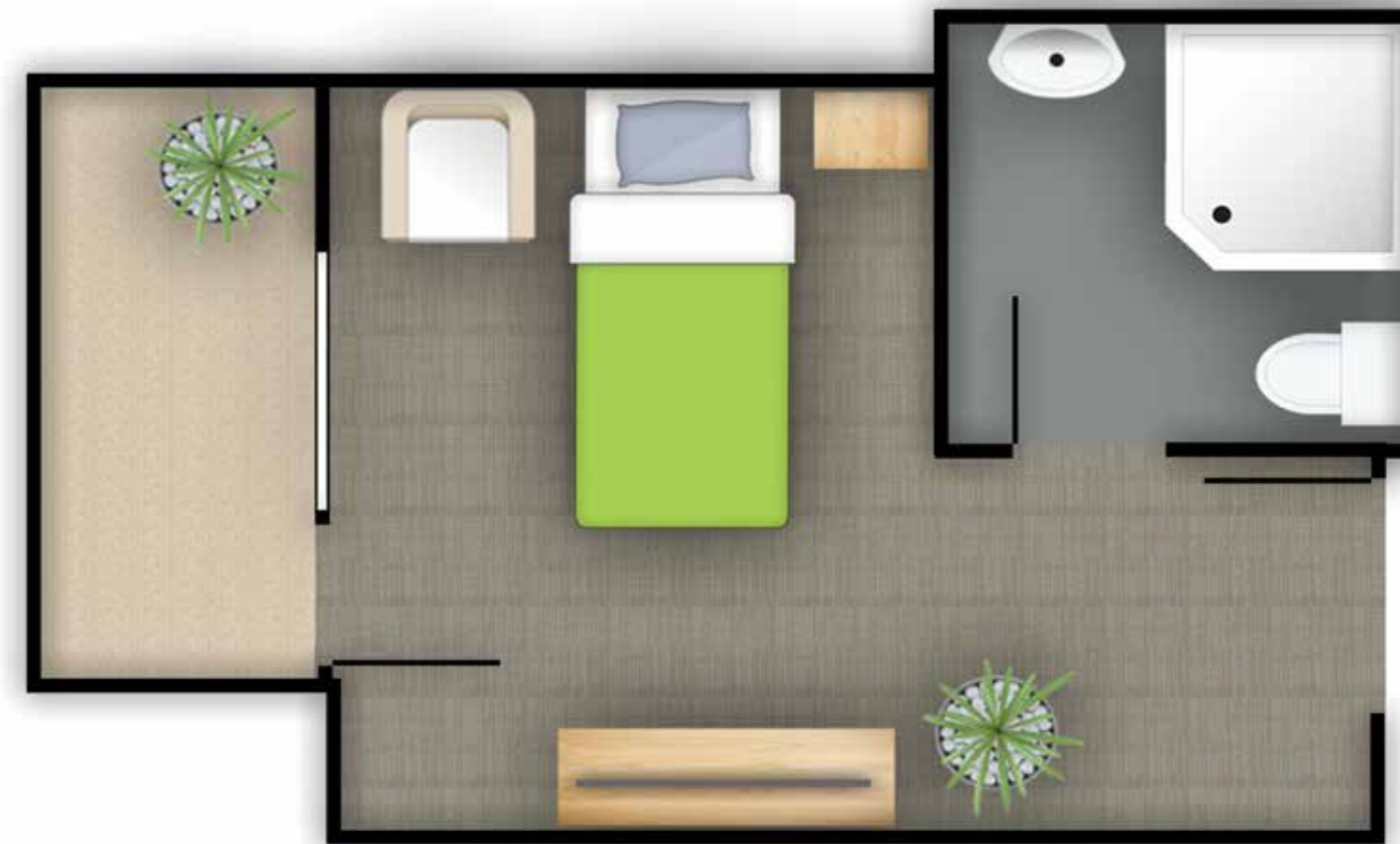
Private, suite Typical