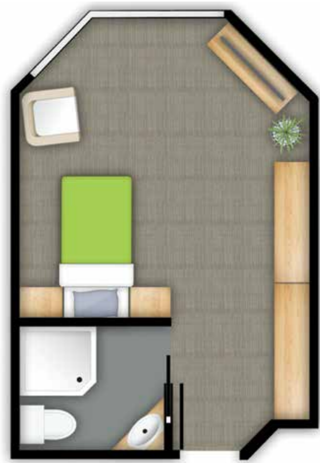
Private, suite Type A & B