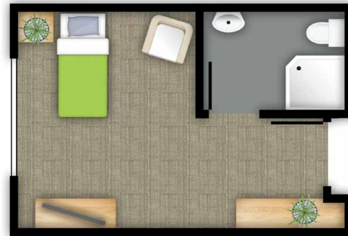
Private, suite Typical