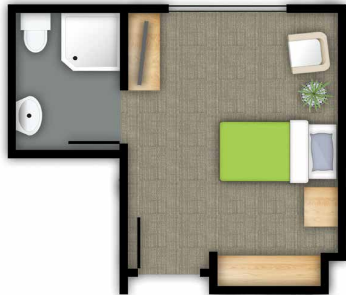
Private, suite Accessible